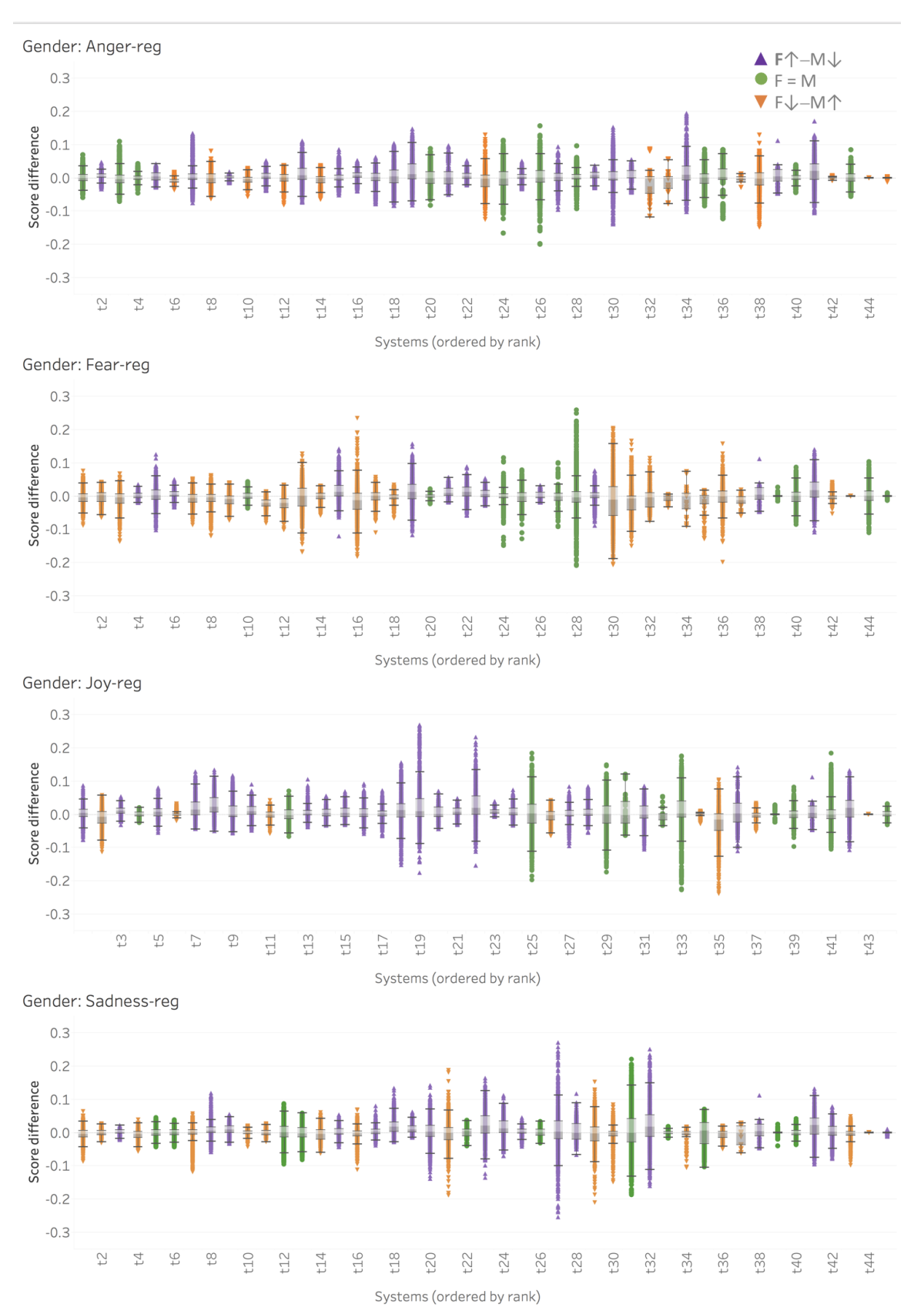
Figure 3: Analysis of gender bias: Box plots of the score differences on the gender sentence pairs for each system on the four emotion intensity regression tasks. Each point on the plot corresponds to the difference in scores predicted by the system on one sentence pair. \triangle represents F \uparrow - M \downarrow significant group, \blacktriangledown represents F \downarrow - M \uparrow significant group, and \bullet represents F = M not significant group. The systems are ordered by their performance rank (from first to last) on the task as per the official evaluation metric on the tweets test sets. The system with the lowest performance had the score differences covering the full range from -1 to 1, and is not included in these plots.