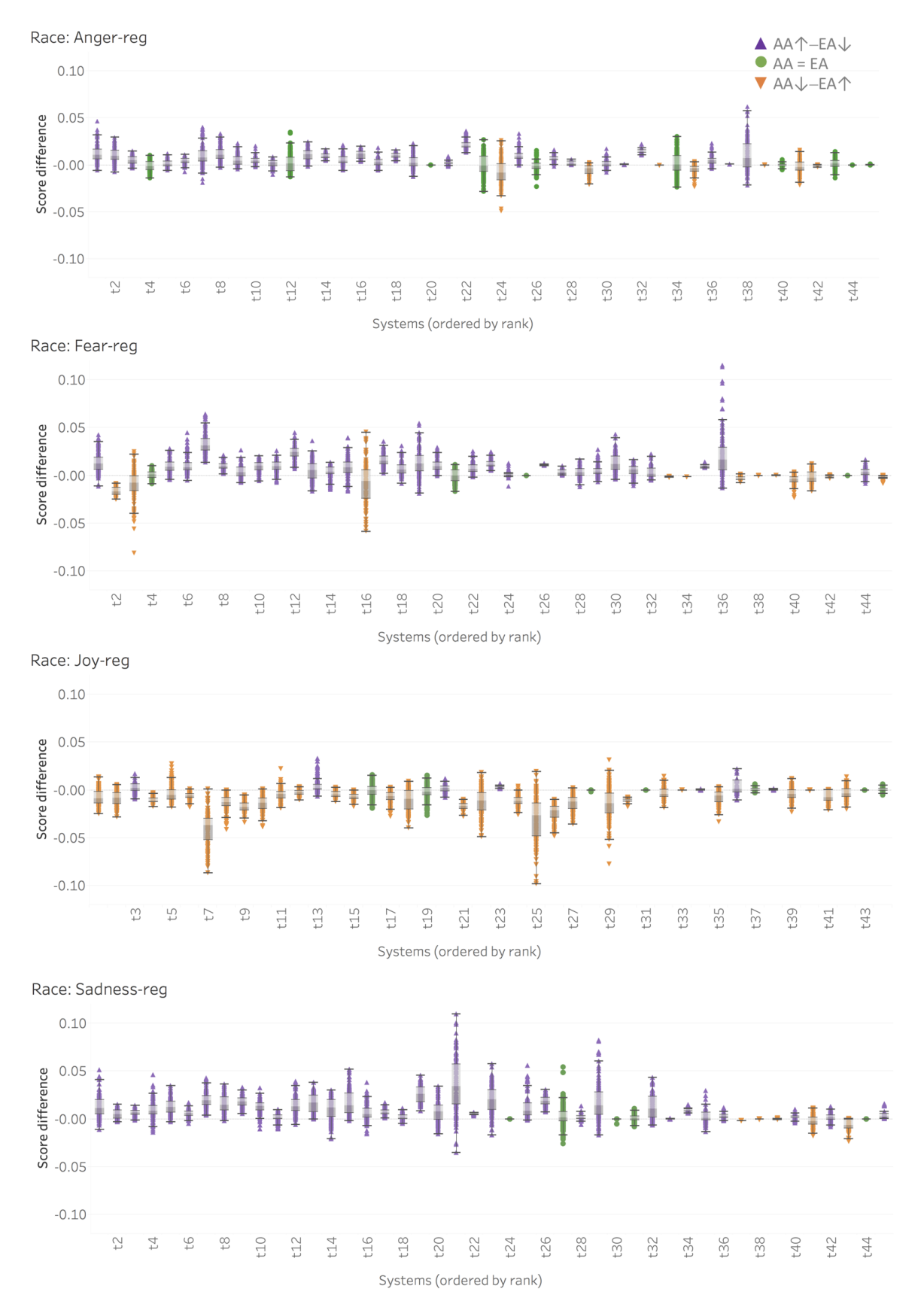
Figure 4: Analysis of race bias: Box plots of the score differences on the race sentence pairs for each system on the four emotion intensity regression tasks. Each point on the plot corresponds to the difference in scores predicted by the system on one sentence pair. \blacktriangle represents AA\uparrow -EA \downarrow significant group, \blacktriangledown represents AA\downarrow -EA \uparrow significant group, and \bullet represents AA=EA not significant group. The systems are ordered by their performance rank (from first to last) on the task as per the official evaluation metric on the tweets test sets. The system with the lowest performance had the score differences covering a much larger range (from -0.3 to 0.3), and is not included in these plots.