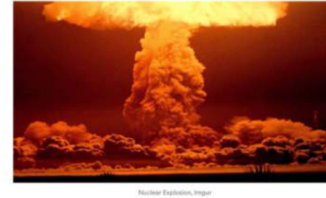
Nuclear Explosion, Image The Plutonium of AI

That Personality Test May Be Discriminating People... and Making Your Company Dumber